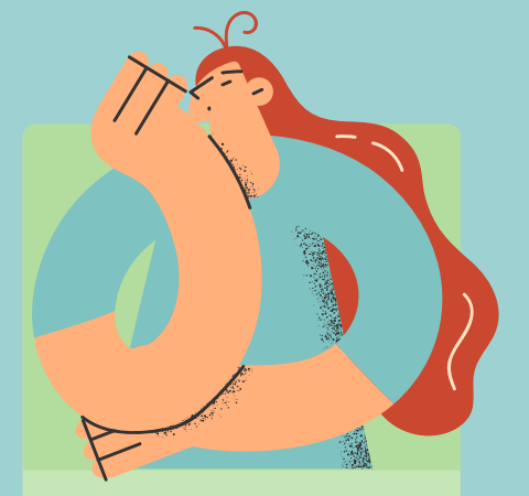
My loved one was recently diagnosed and I'm new to CF care center visits.